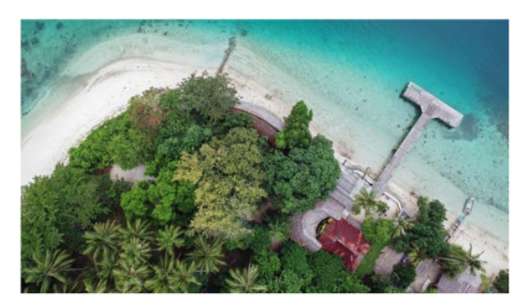
Figure 1. Miti Island, North Halmahera Regency

As can be We see above , in figure 1 ie Photo island myth. Island the own beauty alone if seen from top. Not only beauty natural just be destination for tourists but also beauty nature and green plants as well as apparition sea blue make anybody want to go to island this.