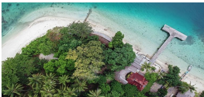
Figure 1. Miti Island , North Halmahera Regency

2009 study by Pitana and Diarta about impact tourism : 184) “ Impact is how to program tourism and its products interact with various field , incl environment economy , which produces social , cultural , physical , technological and politics . Impact economy Objective from study This is For know How Power pull product tour from Island Miti influence economy village Miti . 2009, Diarta and Pitana : 184; 206), “ Impact economy from tourism ; Benefit change pound value , increasing health economy international , make money from tourist or industry services , absorb power work , earn benefits , use location tourism by residents local , boost request product local , reduce use land and activities _ other . Objective from evaluation environment This is For evaluate impact tourism on the Island Miti and daya pull the tour . And 2009 Pitana : 184; “ Environment nature is also very important and can make something area become objective no tour _ replaceable ,” he wrote in 2006. On the other hand, no can denied that related activities _ with Tourism in a region has an impact on the environment nature , which became attention main for development tourist No damage environment nature .